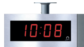
N.Sxx Ceiling suspension single-sided